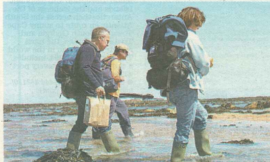
POOLS OF PLENTY: Check out the sea life on the way to the tower

Jersey Tourism: 01534 448800/ www.jersey.com