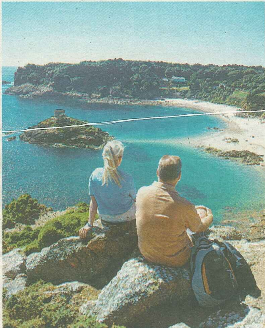
BIRD'S EYE VIEW: The azure waters of the Royal Bay of Grouville

Downstairs is a kitchen area with a table and chairs and two bunks for the guide and one guest. Upstairs is one room with high windows and six bunks.